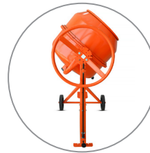
Handles for discharge