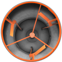
Drum with reinforced opening and 3 double mixing blades