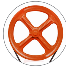
Poly - V cast iron and trapezoidal belt