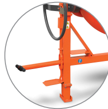
Handles for shifting