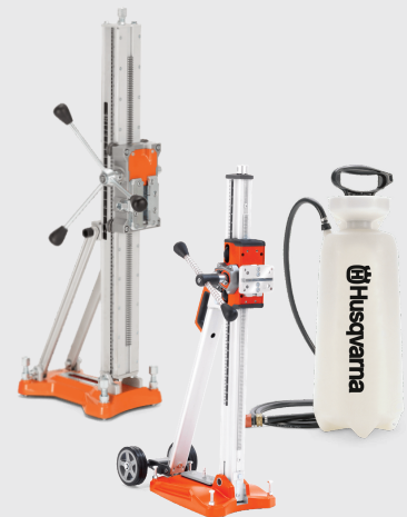
DS 500 / DS 250 Pressurized water tank (Optional)