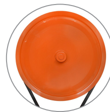
Poly - V iron and trapezoidal belt