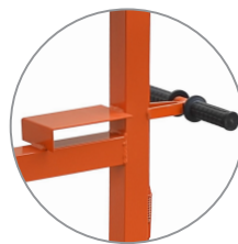
Handles for shifting