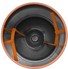
Drum with reinforced opening and 2 double mixing blades