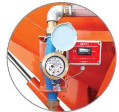
Water meter (optional)