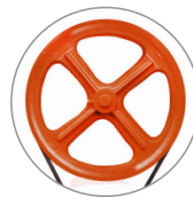
Poly - V cast iron and trapezoidal belt